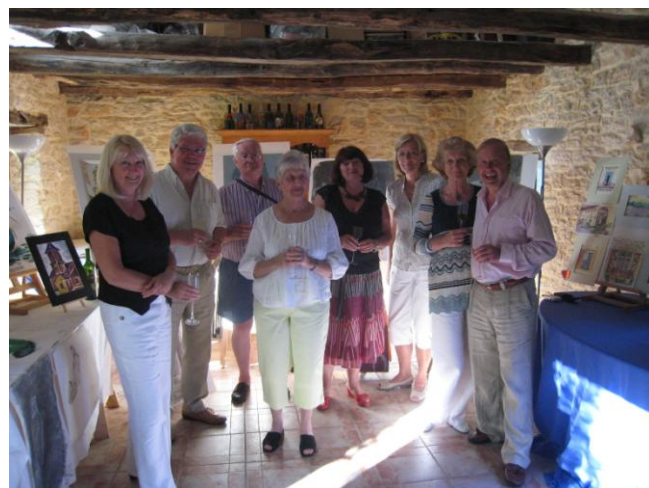
The week ends with a mini exhibition and a celebratory toast